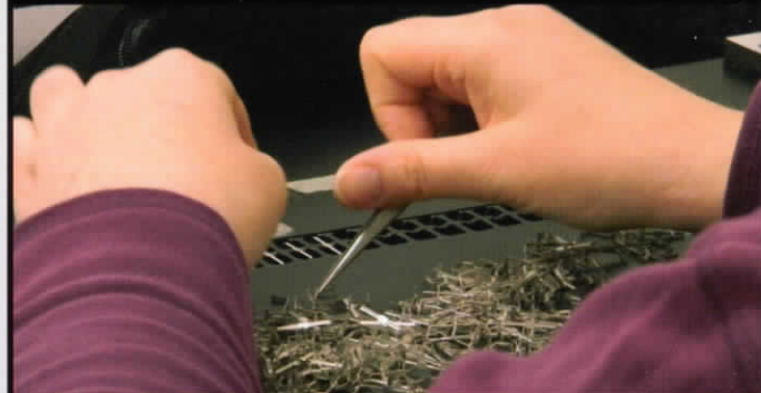
Manual equipping for custom solutions