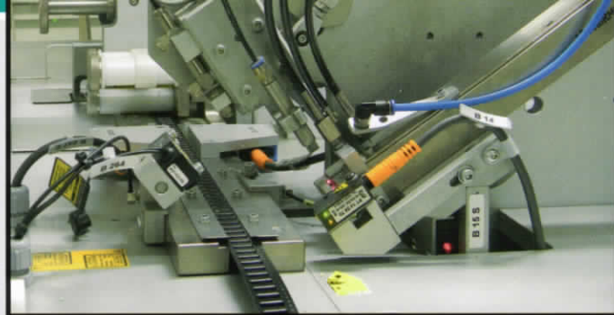
Fully automatic equipping with parts checking